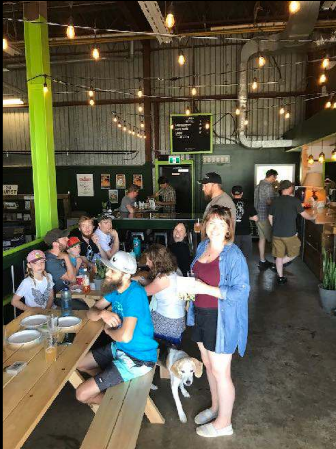
Follow up - Homebrew Tap Takeover