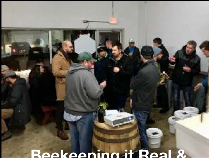
Beekeeping it Real & Hayhoe Hops