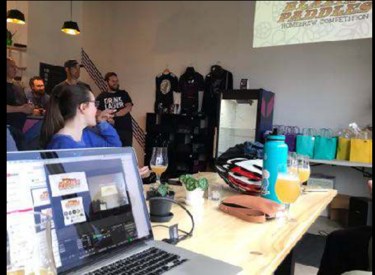
July - Awards