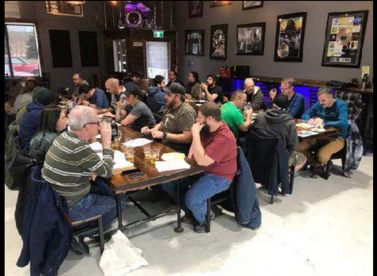
Nov - Rhythm and Brews

BJCP accredited 11 judges took advantage in most recent sessions