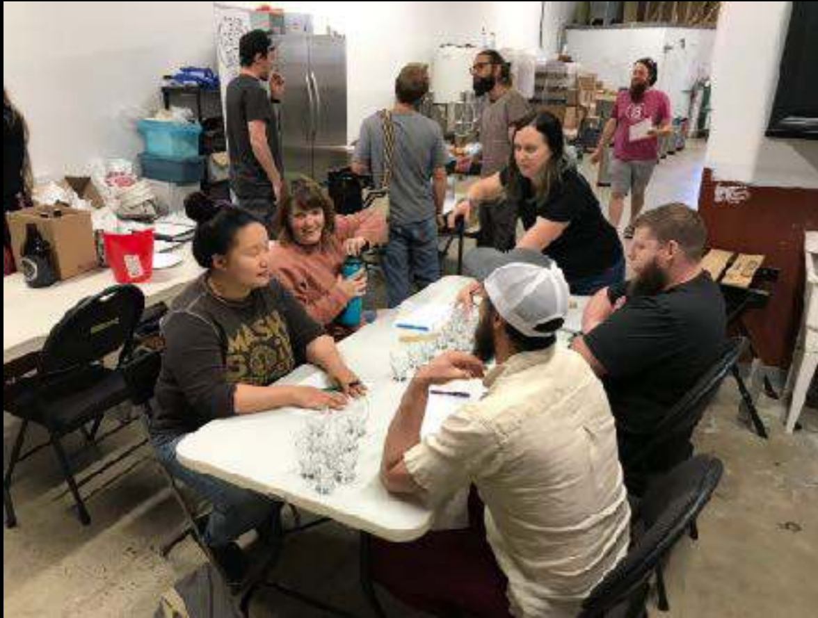
June - Judging